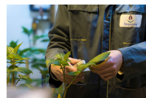
Agronomic evaluations in growth chambers or greenhouses