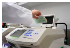
Molecular Biology Lab